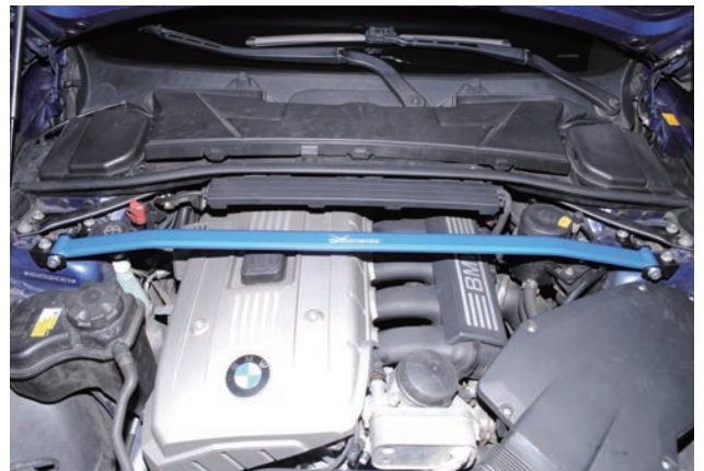
Illustration of installed state 完成示意圖