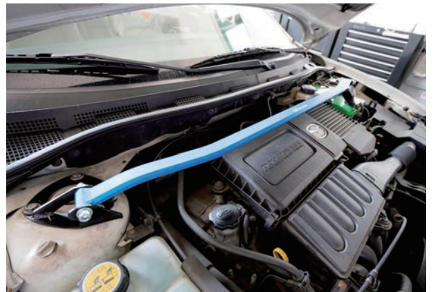
Illustration of installed state 完成示意圖