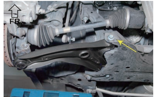
Illustration of installed state 完成示意圖