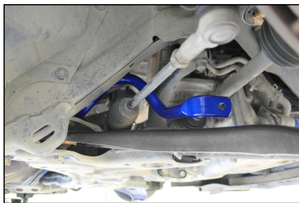
Illustration of installed state 安裝完成示意圖